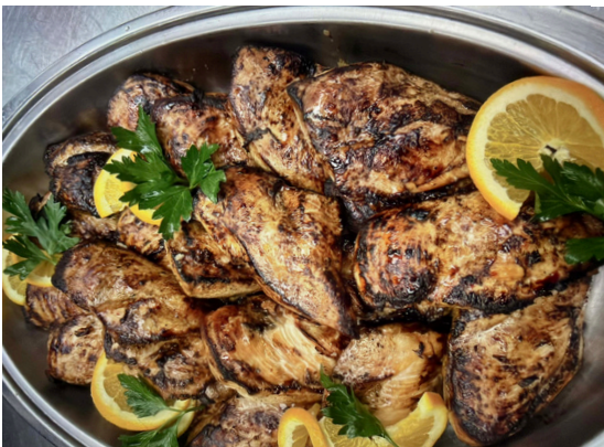
Lunch Buffet: Honey Baked CHicken

Chocolate Chip, Macadamia Nut, Oatmeal Raisin, Sugar