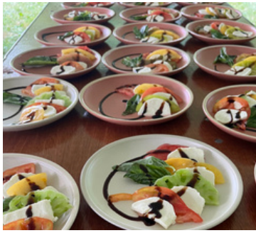
Heirloom Tomato & Buffalo Mozzarella, Balsamic Drizzled