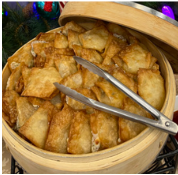
Cream Cheese Wontons