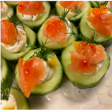
Smoked Salmon Canapés