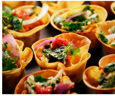
Asian Wonton Cups